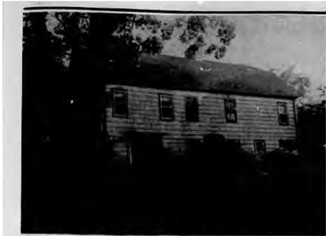
THE PRATT HOUSE on 30 Valley Road in Council, may solve some of the town's Watchung, recently acquired by the Borough recreational needs.